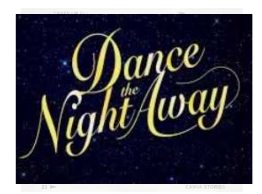
DANCE THE NIGHT AWAY!

Help us recognize and celebrate those in our industry who go above & beyond.